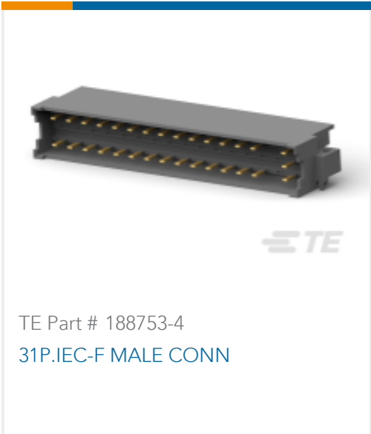
TE Part # 188753-4 31P IEC-F MALE CONN