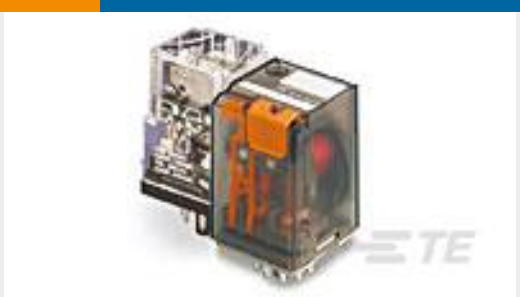
TE Part # 4-1393104-6 KRPA-11DG-48=KRPA