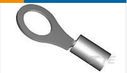
TE Part # 35684 TERMINAL,SOLIS R 14-12 6