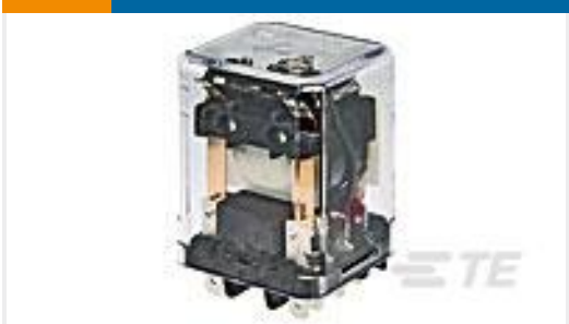
TE Part # 9-1393113-7 KUEP-3D15-110=KU