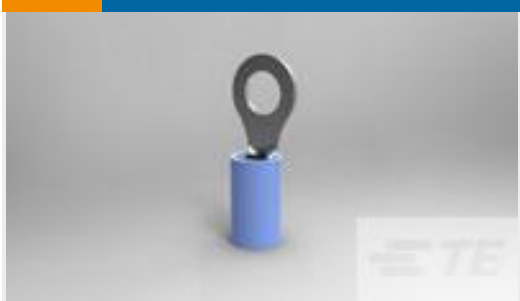
TE Part # 53942-1 TERMINAL,PIDG R 16-14 10