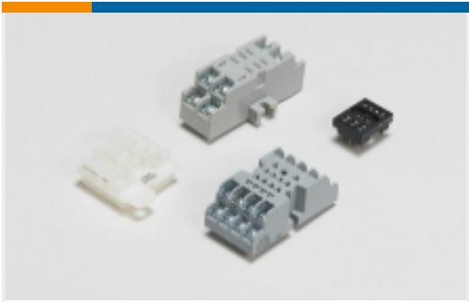
Relay Accessories, Sockets & Clips(5)