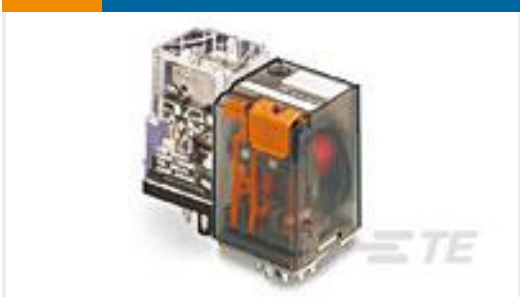
TE Part # 6-1393104-5 KRPA-14AG-120=KRPA