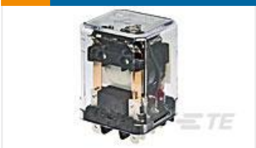
TE Part # 1-1393114-1 KUEP-7D15-24=KU