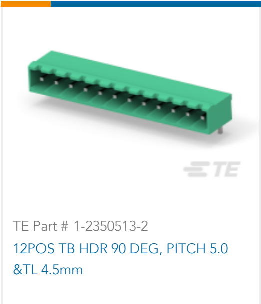
TE Part # 1-2350513-2 12POS TB HDR 90 DEG, PITCH 5.0 &TL 4.5mm