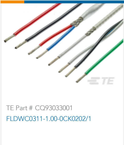
TE Part # CQ93033001 FLDWC0311-1.00-0CK0202/1

4POS TB HDR 90 DEG, PITCH 5.0 & TL 4.5mm