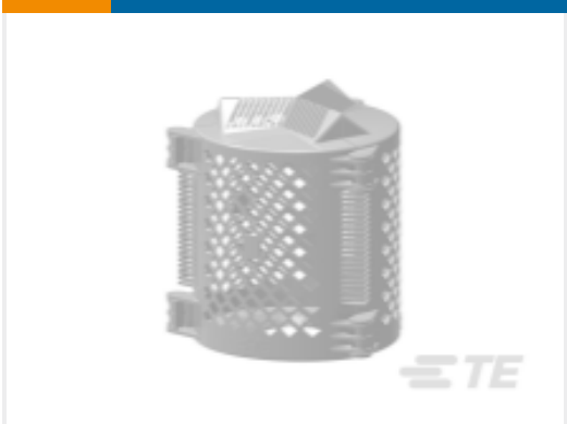
TE Part # 337774-000 BCAC-G-IC-5D/6(B6)