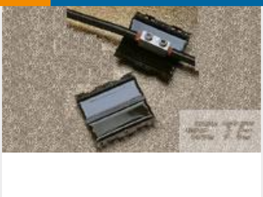
TE Part # 408971-000 GILS-4/0(B18)