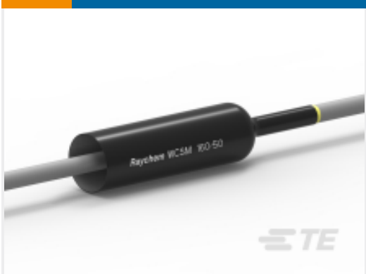
TE Part # EE0471-000 Thick-Wall Heat Shrink Tubing