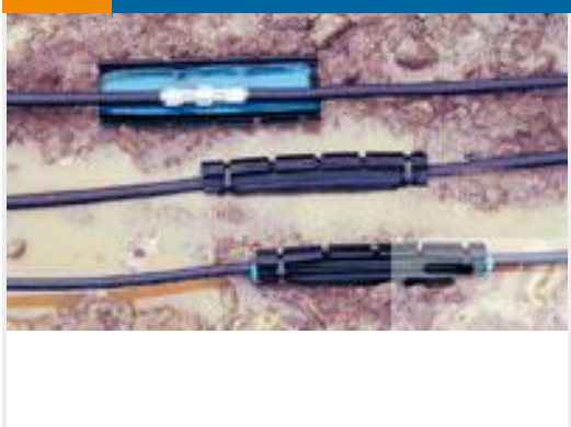
TE Part # F60655-000 GELWRAP-18/4-200(B6)