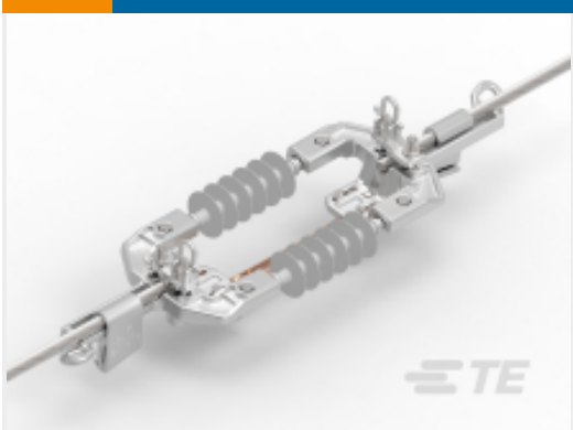
TE Part # 1710723-6 15kILD-KS9C-w/T-556.5