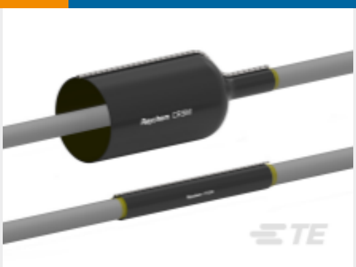
TE Part # 842515-000 Wraparound Sleeve for Cable Repair