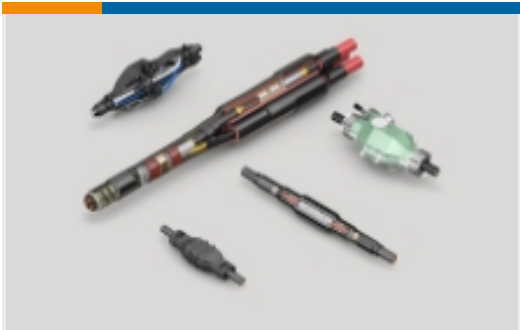
Joints & Splices(24)