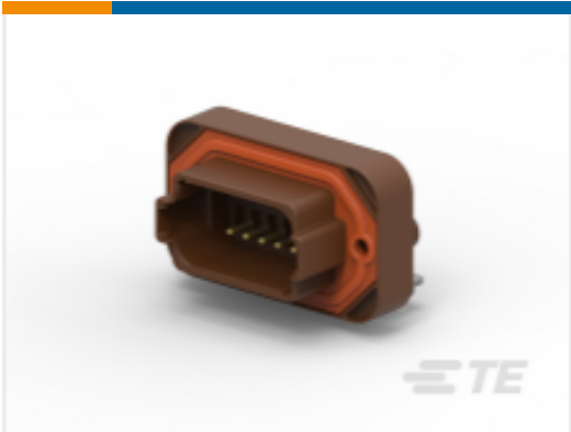
TE Part # DT13-12PD HDR, 12P, BRN, RA, NI/CU, D