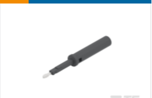
TE Part # 1SNK900205R0000 TP4