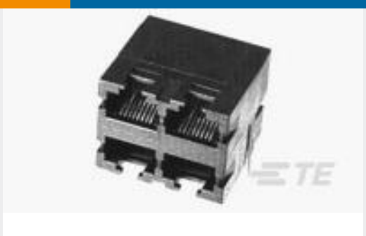
TE Part # 5569260-1 STK MJ ASSY,8POS,2X2,SHLD,CAT5