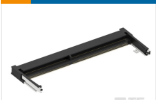
TE Part # 2309409-2 DDR4 SODIMM 260P 5.2H STD