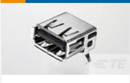
TE Part # 292303-1 Std USB Type A, R/A, T/H