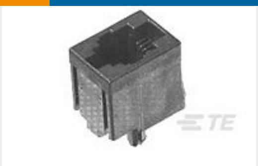
TE Part # 5520258-2 MJ,TE,6P/4C,PNL STOPS,TRAY P