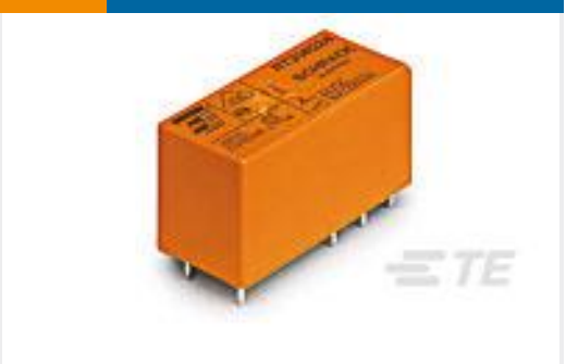
TE Part # 1-1393243-0 RTE24024