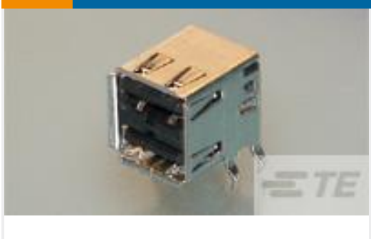
TE Part # 5787617-1 RECP ASSY, R/A, STACKED, THRU-HOLE, USB,