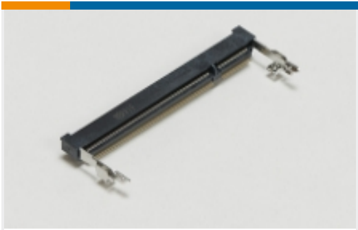
SO DIMM Sockets(39)