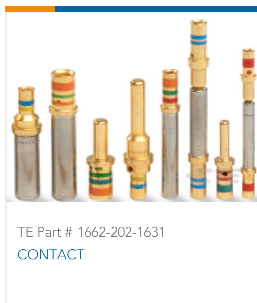
TE Part # 1662-202-1631 CONTACT