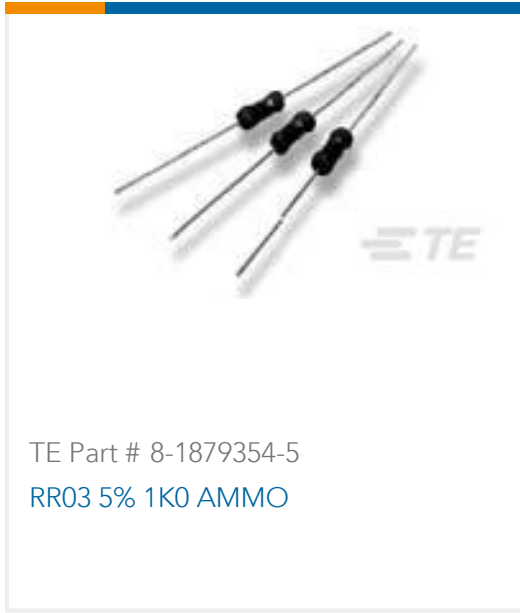
TE Part # 8-1879354-5 RR03 5% 1K0 AMMO