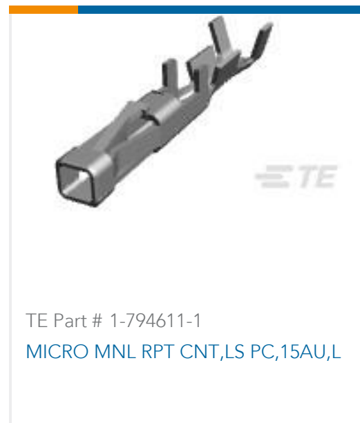
TE Part # 1-794611-1 MICRO MNL RPT CNT,LS PC,15AU,L