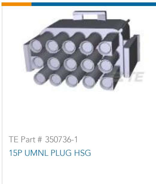
TE Part # 350736-1 15P UMNL PLUG HSG