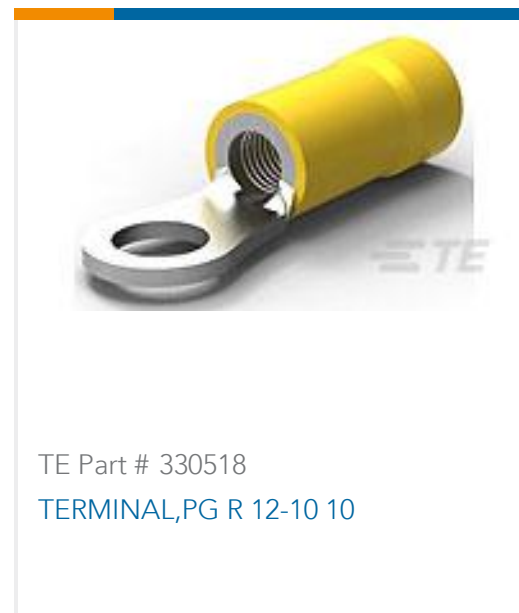
TE Part # 330518 TERMINAL,PG R 12-10 10