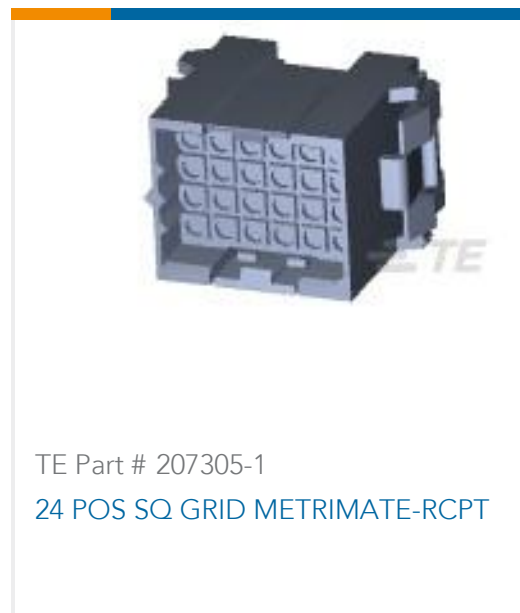
TE Part # 207305-1 24 POS SQ GRID METRIMATE-RCPT