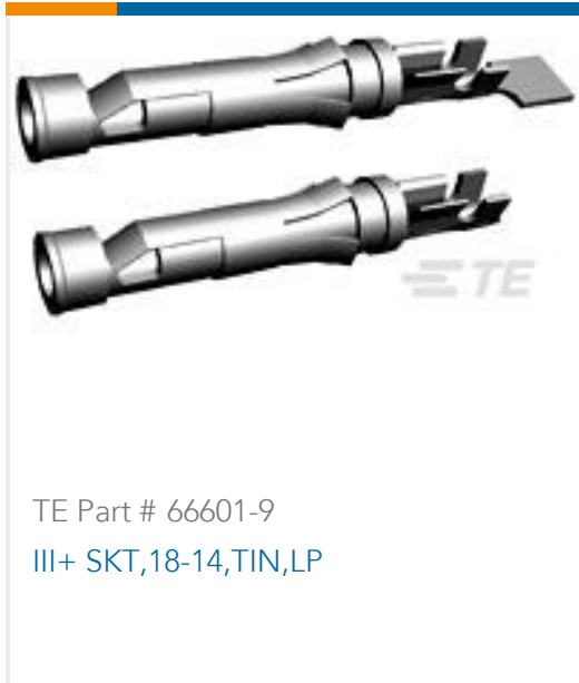
TE Part # 66601-9 III+ SKT,18-14,TIN,LP