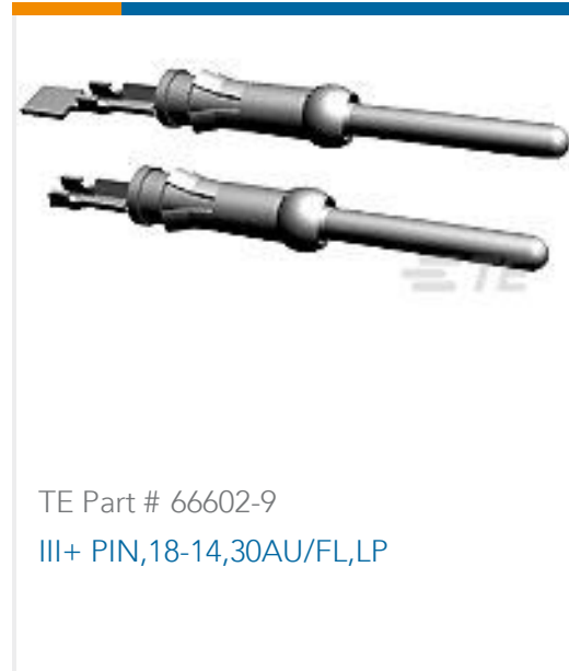
TE Part # 66602-9 III+ PIN,18-14,30AU/FL,LP