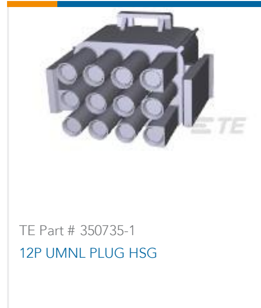
TE Part # 350735-1 12P UMNL PLUG HSG