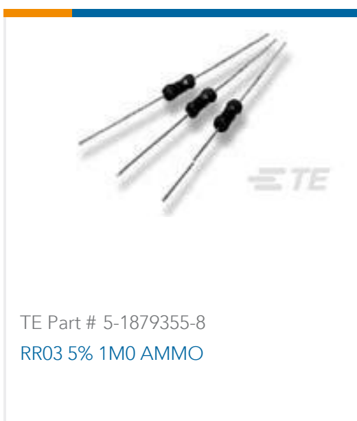
TE Part # 5-1879355-8 RR03 5% 1M0 AMMO