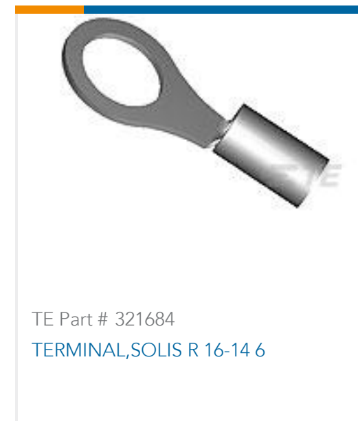
TE Part # 321684 TERMINAL,SOLIS R 16-14 6