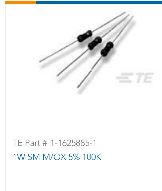
TE Part # 1-1625885-1 1W SM M/OX 5% 100K