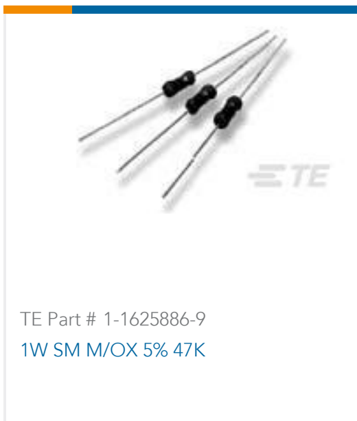
TE Part # 1-1625886-9 1W SM M/OX 5% 47K