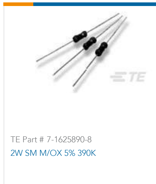
TE Part # 7-1625890-8 2W SM M/OX 5% 390K