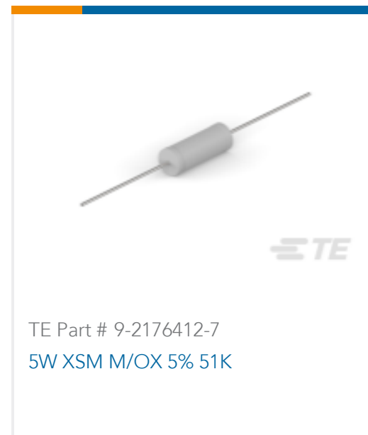
TE Part # 9-2176412-7 5W XSM M/OX 5% 51K