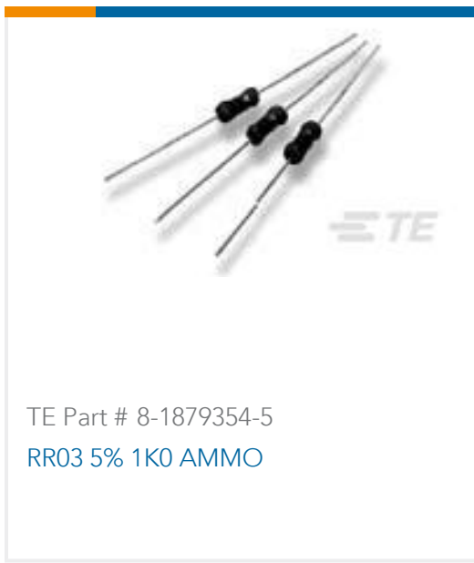
TE Part # 8-1879354-5 RR03 5% 1K0 AMMO