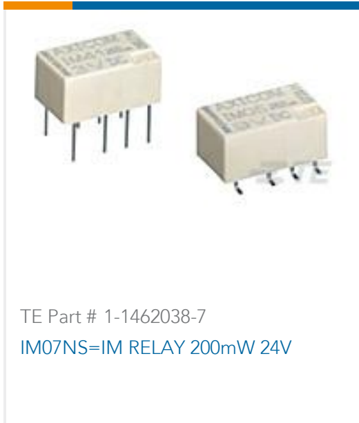
TE Part # 1-1462038-7 IM07NS=IM RELAY 200mW 24V