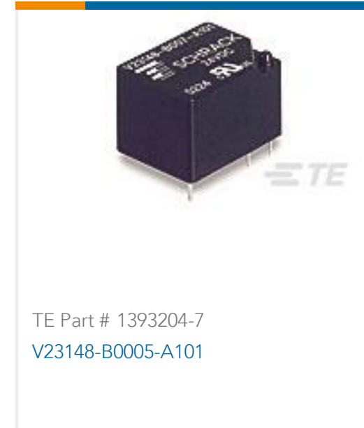
TE Part # 1393204-7 V23148-B0005-A101