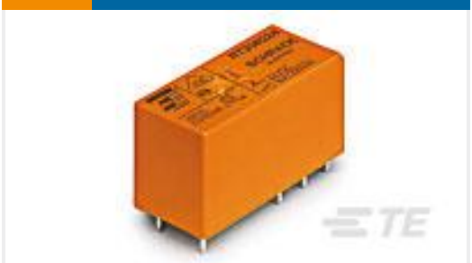
TE Part # 1415898 RTS3T012