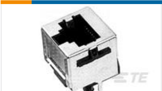
TE Part # 5406436-1 MJ,TE,8P,SHLD W/PNL STPS