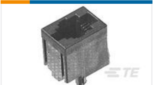
TE Part # 5520258-2 MJ,TE,6P/4C,PNL STOPS,TRAY P