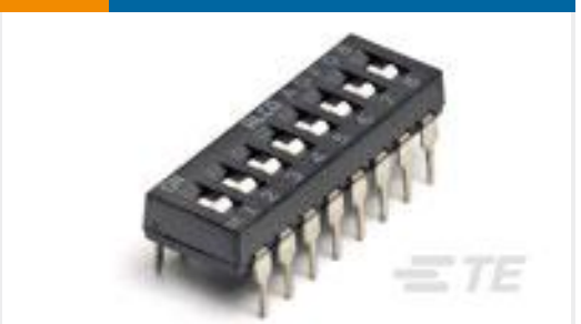
TE Part # 4-1825059-2 ADF08STTR04=DIP S,FLUSH,SMT-GW