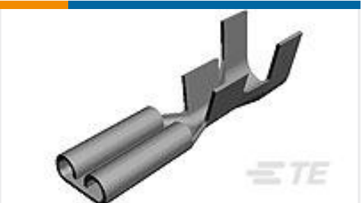
TE Part # 60197-1 110 FASTON REC 22-18 AWG TPBR