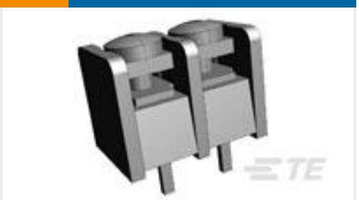
TE Part # 2-1437667-4 4DB-P108-02=4DB ASSEMBLY