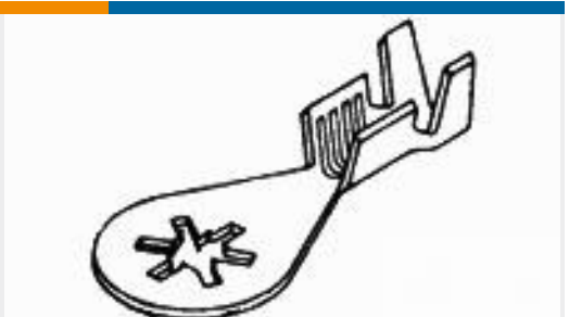
TE Part # 61793-1 RING 18-14 AWG TPST