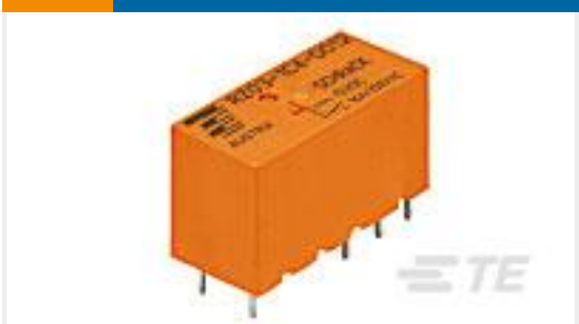
TE Part # 5-1415899-5 RZ03-1C3-D024