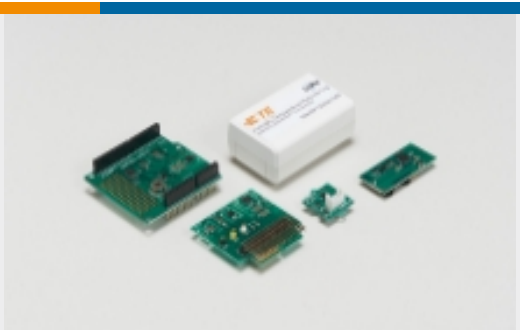
Sensor Development Boards and Evaluation Kits(3)