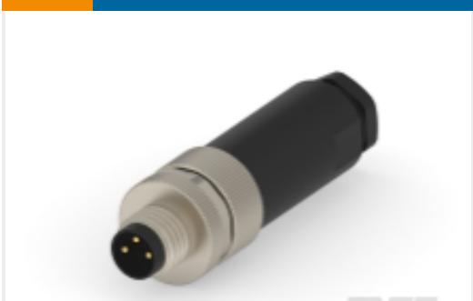
TE Part # T4011008031-000 M8,SCREW, MALE,S,UNSHIELD,3P, GOLD