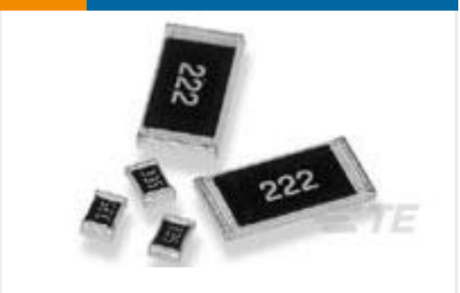
TE Part # 1623096-1 CRG0805 1% 100R