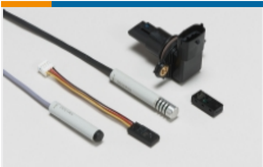
Humidity Sensor Assemblies(4)