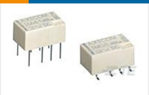
TE Part # 3-1462039-2 IM26TS=IM RELAY 50mW 12V