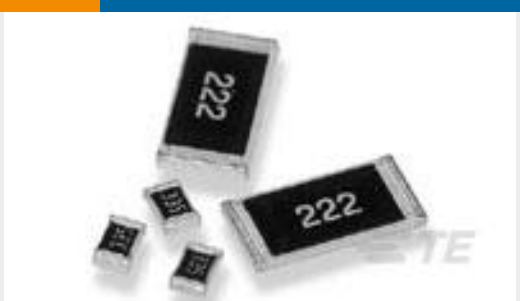
TE Part # 1623450-1 CRG1206 1% 1M0