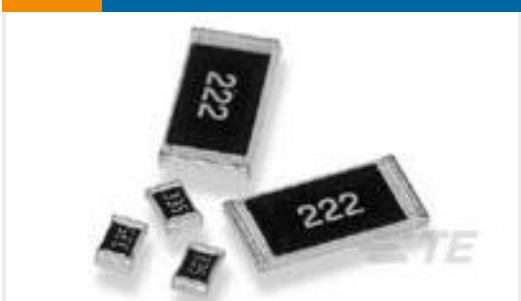
TE Part # 1622829-1 CRG0603 1% 10K