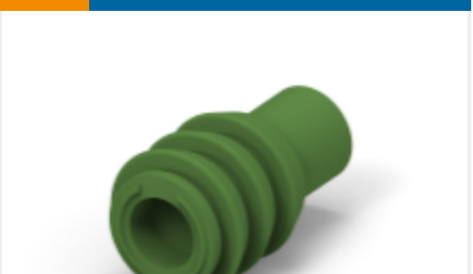
TE Part # 2287497-1 SINGLE WIRE SEAL,1.5MM CONTACT SYSTEM