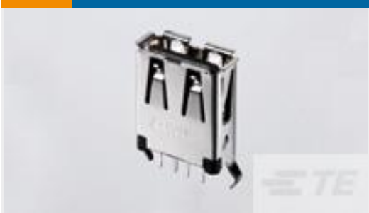
TE Part # 1734366-1 Std USB Type A, VT, T/H