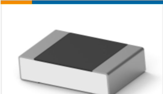
TE Part # 9-2176376-6 RQ 0805 121K 0.1% 10PPM 1K RL