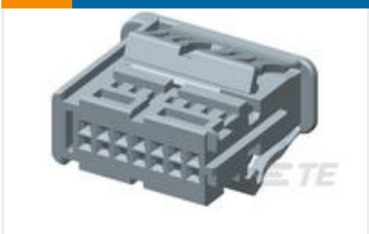
TE Part # 2141404-1 20POS,NANOMQS,REC HSG,CODE A