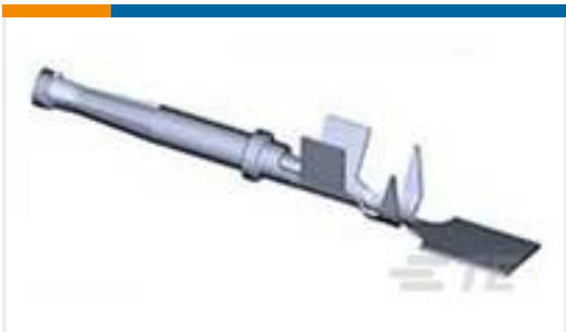
TE Part # 1062-20-0322 SOC, SF, SIZE 20, 16-22, SLEVLESS, NI /NI