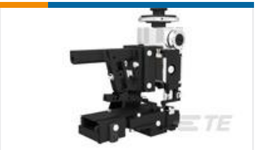
TE Part # 2266120-1 OCEAN_2.0_APPLICATOR-S-069F052O-RSM