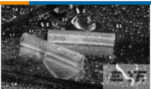
TE Part # 085193P002 ES1000-NO.4-B7-X-75MM