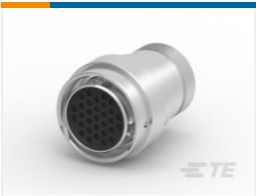
TE Part # HD36-24-31SE-L005 PLG, 31P, AL, E, THD ADPT, NO DRAIN,16,S