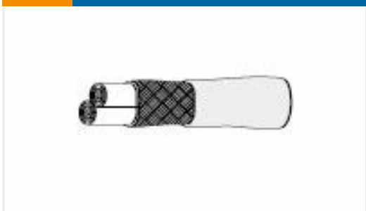
TE Part # 316052-000 55A1121-20-9/96-9