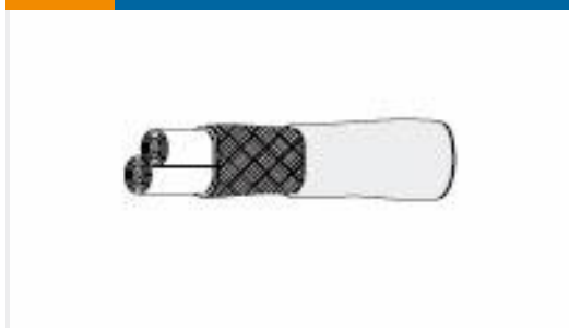
TE Part # 316034-006 55A1121-22-2/6-9