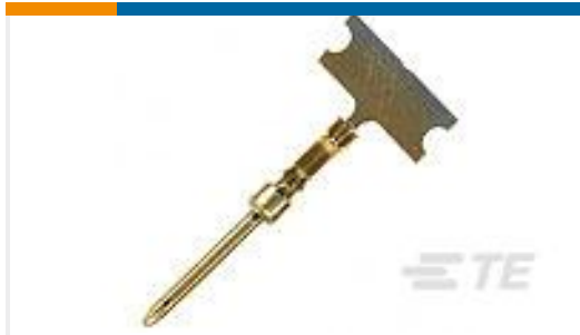
TE Part # 166053-1 COSI PIN CONTACT HD20 DF; 24-20 AWG