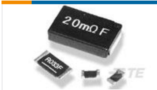
TE Part # 1879378-8 TLR 2512 2.0W R00075 1% 50PPM 2K RL