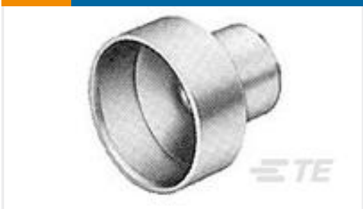
TE Part # 3-747579-2 SHLDNG FERRULE, PLTD, BULK PKG