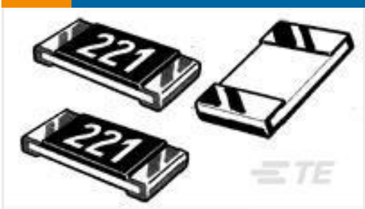
TE Part # 6-2176230-6 3522 220K 5% 3W