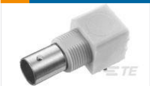
TE Part # 227161-1 RTANG JK W/MTG PINS, BNC PCB