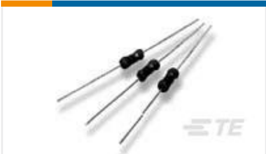
TE Part # 3-1879355-8 RR03 5% 150K AMMO