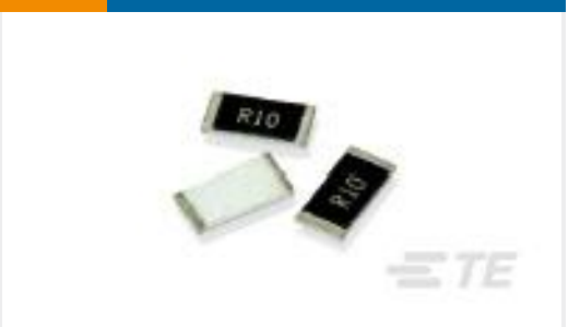
TE Part # 3-2176057-0 RLP73K 3A R16 1% 1K RL