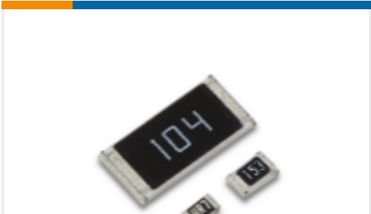
TE Part # 4-2176339-0 CRGCQ 0603 18K 1%