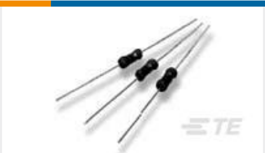
TE Part # 5-1879351-3 RR01 5% 430K AMMO