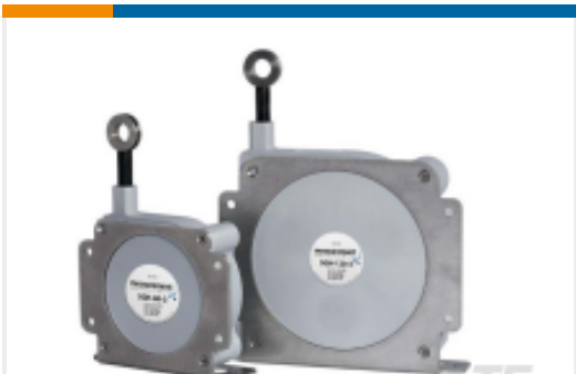
TE Part # SGD-80-3 STRING POT, 80 INCH RANGE