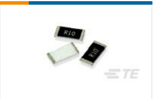
TE Part # 2176058-8 RLP73V 3A R020 5% 2K RL