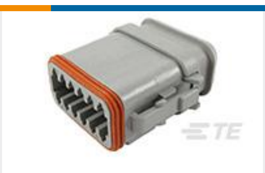
TE Part # DT06-12SA-E008 PLG, 12P, GRY, N, XCAP, A