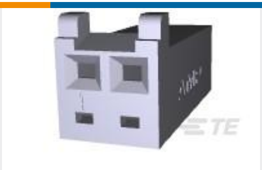
TE Part # 1375820-2 CST-100 II HOUSING 2 POS