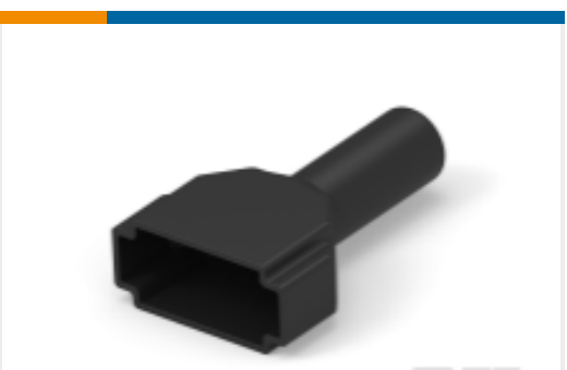
TE Part # DT12S-BT-BK BOOT, 12P, PLG, ST, BLK