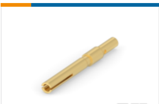
TE Part # 1-2314103-2 M12 CRIMP CONTACT SOCKET 1MM AU 0.8AWG22