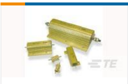
TE Part # 1630186-6 HSA50 25R 5%