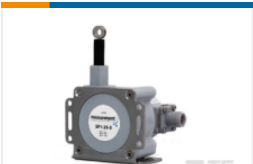
TE Part # SP1-12-3 STRING POT 12 INCH RANGE