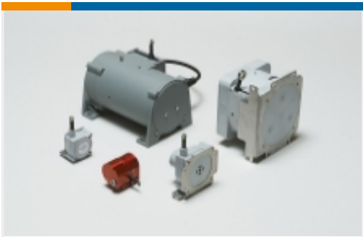
Cable Actuated Position Sensors(22)