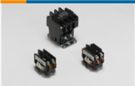
Definite Purpose Contactors(1)