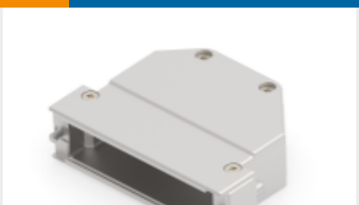
TE Part # 1-2308346-1 FULL METAL HOODS SIZE 5