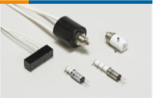
High Voltage Relays(13)