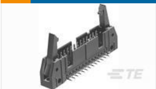
TE Part # 5499345-1 A/L UNIV HDR 10P RA SHT LAT