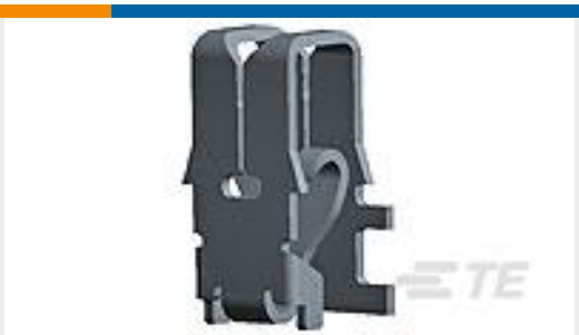
TE Part # 63658-5 TERM,POKE-IN,MAG-MATE