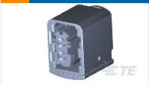
TE Part # 1-1418483-1 2POS,AMP MCP2.8,REC. HSG,CODA