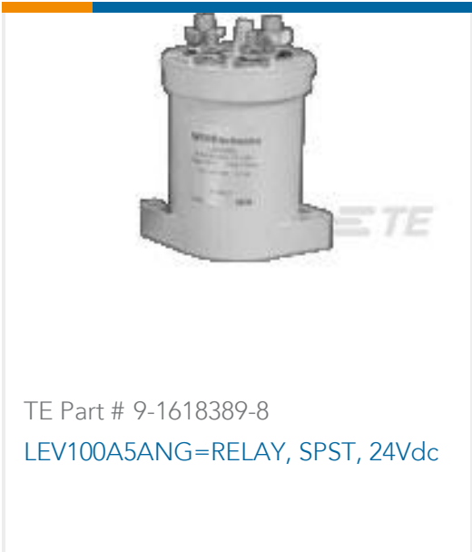
TE Part # 9-1618389-8 LEV100A5ANG=RELAY, SPST, 24Vdc