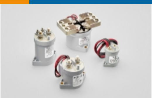
General Purpose Contactors(4)