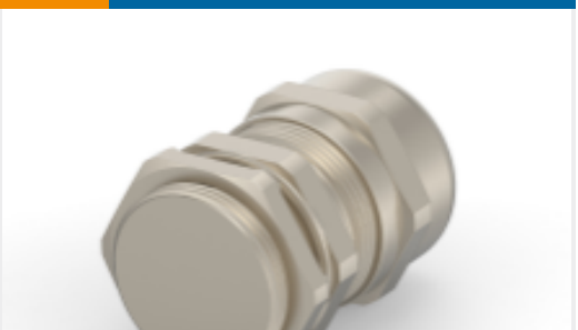
TE Part # 1478885-5 PG EMC GLAND PG16