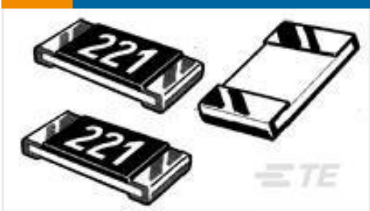
TE Part # 9-2176070-1 3521 56K 1% 2W