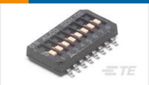
TE Part # 1-1571983-1 GDH08STR04=DIP SWITCH