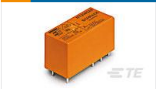
TE Part # 2-1415898-4 RTS3LA24