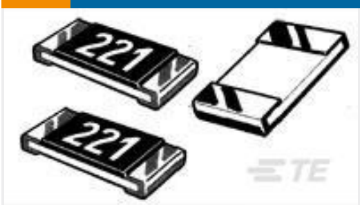
TE Part # 3-2176231-9 3522 390R 1% 3W