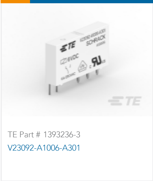
TE Part # 1393236-3 V23092-A1006-A301

This information is provided based on reasonable inquiry of our suppliers and represents our current actual knowledge based on the information they provided. This information is subject to change. The part numbers that TE has identified as EU RoHS compliant have a maximum concentration of 0.1% by weight in homogenous materials for lead, hexavalent chromium, mercury, PBB, PBDE, DBP, BBP, DEHP, DIBP, and 0.01% for cadmium, or qualify for an exemption to these limits as defined in the Annexes of Directive 2011/65/EU (RoHS2). Finished electrical and electronic equipment products will be CE marked as required by Directive 2011/65/EU. Components may not be CE marked. Additionally, the part numbers that TE has identified as EU ELV compliant have a maximum concentration of 0.1% by weight in homogenous materials for lead, hexavalent chromium, and mercury, and 0.01% for cadmium, or qualify for an exemption to these limits as defined in the Annexes of Directive 2000/53/EC (ELV). Regarding the REACH Regulation, the information TE provides on SVHC in articles for this part number is based on the latest European Chemicals Agency (ECHA) 'Guidance on requirements for substances in articles' posted at this URL: https://echa.europa.eu/guidance-documents/guidance-on-reach