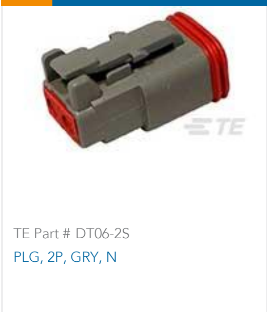
TE Part # DT06-2S PLG, 2P, GRY, N