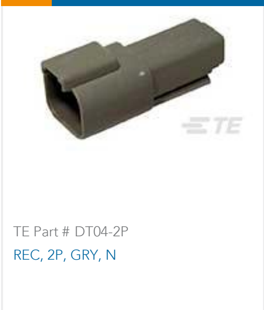
TE Part # DT04-2P REC, 2P, GRY, N