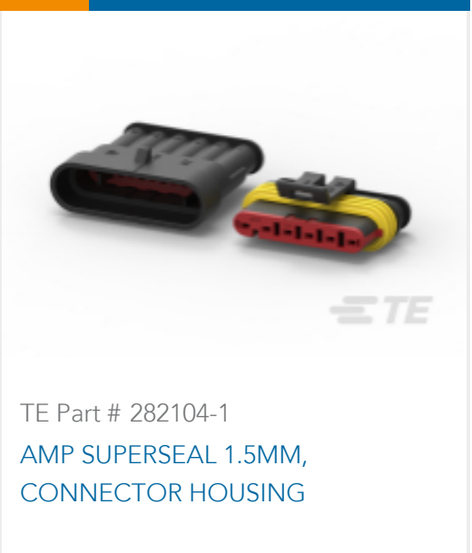
TE Part # 282104-1 AMP SUPERSEAL 1.5MM, CONNECTOR HOUSING