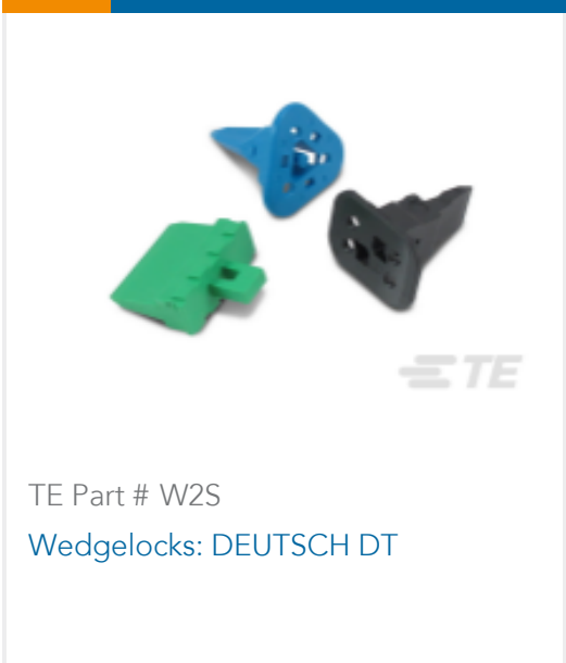
TE Part # W2S Wedgelocks: DEUTSCH DT