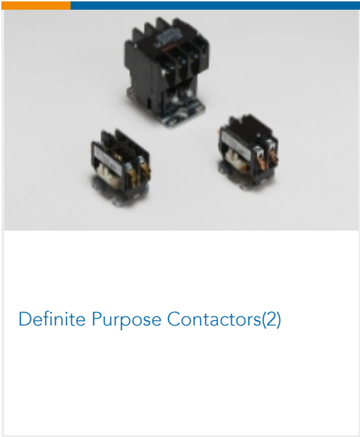
Definite Purpose Contactors(2)