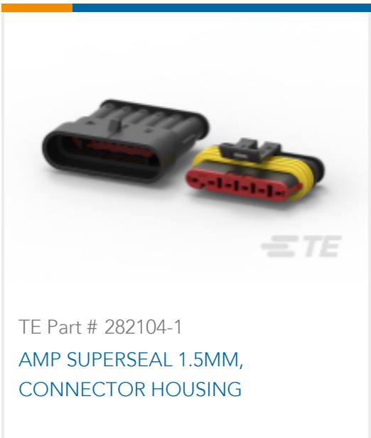
TE Part # 282104-1 AMP SUPERSEAL 1.5MM, CONNECTOR HOUSING