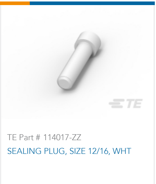
TE Part # 114017-ZZ SEALING PLUG, SIZE 12/16, WHT