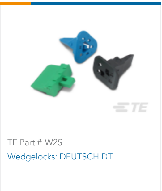
TE Part # W2S Wedgelocks: DEUTSCH DT