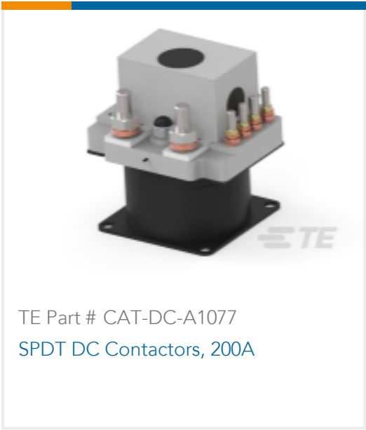
TE Part # CAT-DC-A1077 SPDT DC Contactors, 200A