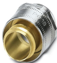
Cable gland made from brass with Pg thread, rotatable, IP40 protection

https://www.phoenixcontact.com/us/products/3241026