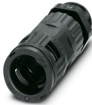
Cable gland, Pg thread, IP66 protection, with strain relief

https://www.phoenixcontact.com/us/products/3240947