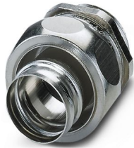
Cable gland made from brass with Pg thread, IP40 protection

https://www.phoenixcontact.com/us/products/3241040