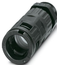
Cable gland, Pg thread, IP68/69k protection, with strain relief

https://www.phoenixcontact.com/us/products/3240933