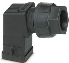
Sleeve housing D7, for single locking latch, material: PA, cable outlets: 1, lateral, M20, height: 54.5 mm, cable gland: with, Standard

Please be informed that the data shown in this PDF document is generated from our online catalog. Please find the complete data in the user documentation. Our general terms of use for downloads are valid.