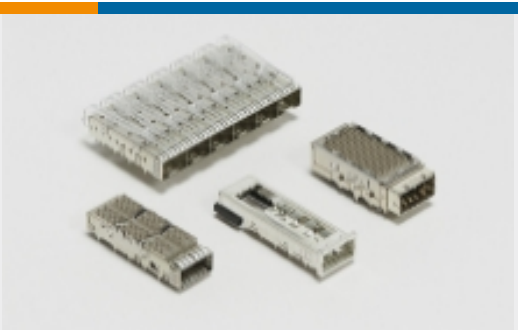
Pluggable IO Connectors & Cages(154)