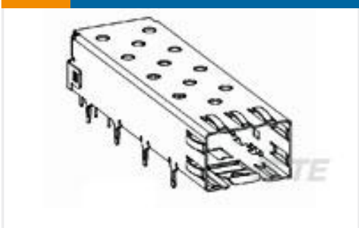
TE Part # 2227302-1 CAGE ASSY, PRESS FIT, SFP