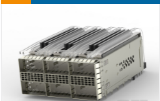
TE Part # 2299924-5 ZQSFP+ STACKED REC ASSEMBLY 2X3,4LP HS