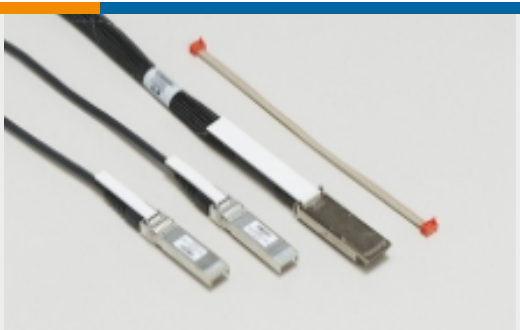
Pluggable I/O Cable Assemblies(19)