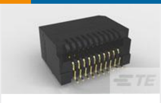
TE Part # 1367073-1 20 POS SMT CONN, SFP, 15AU