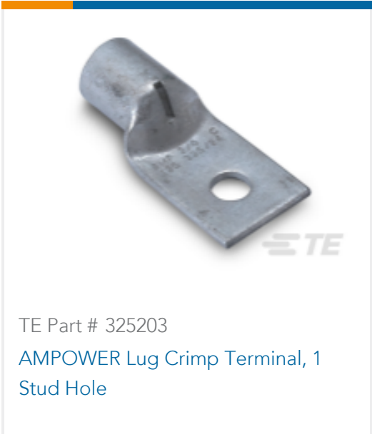
TE Part # 325203 AMPOWER Lug Crimp Terminal, 1 Stud Hole