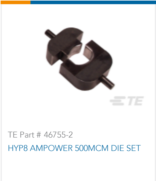
TE Part # 46755-2 HYP8 AMPOWER 500MCM DIE SET