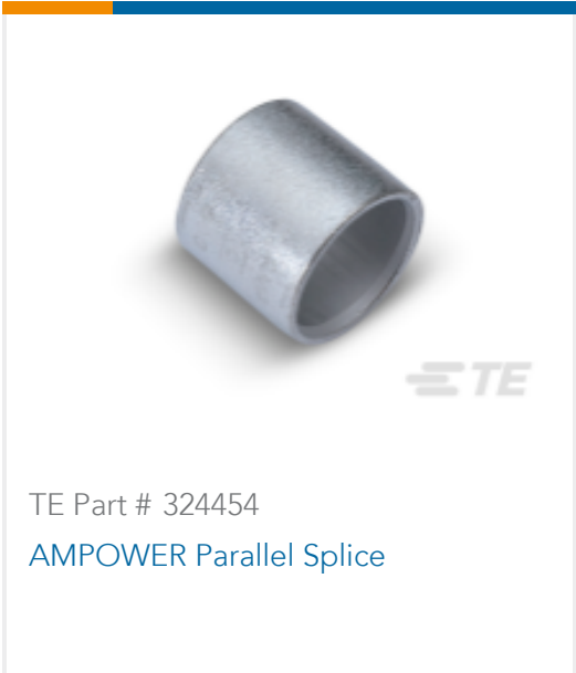
TE Part # 324454 AMPOWER Parallel Splice