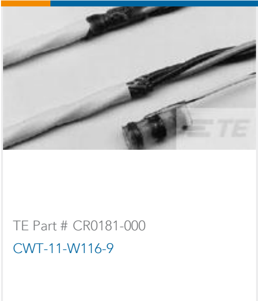
TE Part # CR0181-000 CWT-11-W116-9