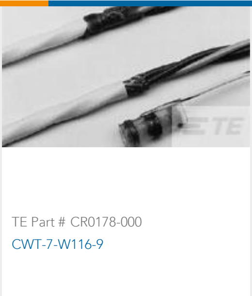
TE Part # CR0178-000 CWT-7-W116-9