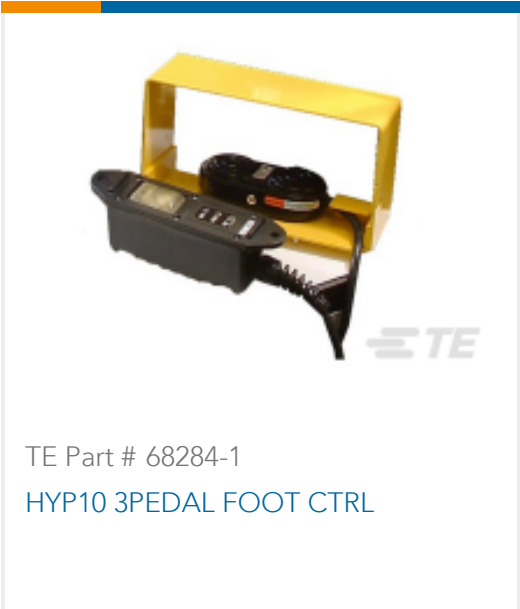
TE Part # 68284-1 HYP10 3PEDAL FOOT CTRL