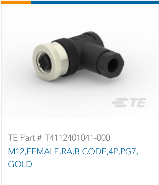
TE Part # T4112401041-000 M12,FEMALE,RA,B CODE,4P,PG7, GOLD