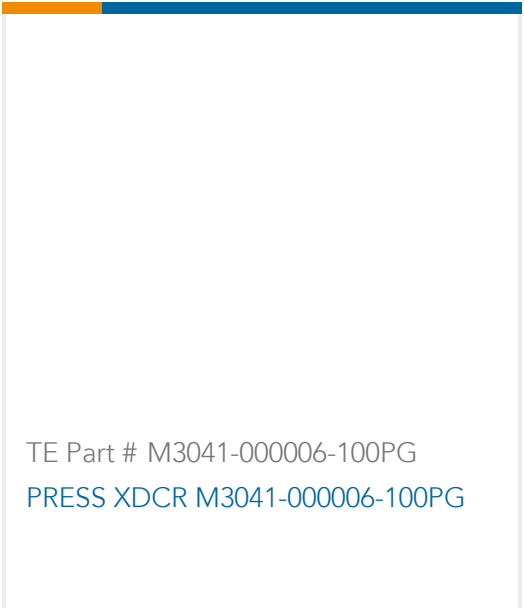
TE Part # M3041-000006-100PG PRESS XDCR M3041-000006-100PG