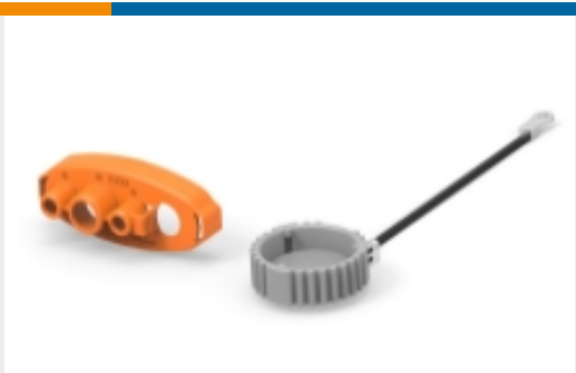
Connector Caps & Covers(16)