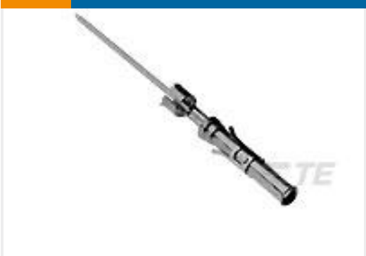
TE Part # 5-66461-5 SKT,.062 DIA,.025 SQ POST,LP