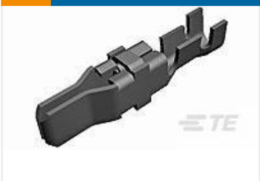
TE Part # 66261-4 MALE CONTACT ASSY. (L.P.)