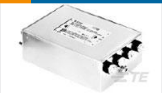
TE Part # 6609068-8 50AYA6A=F7748A