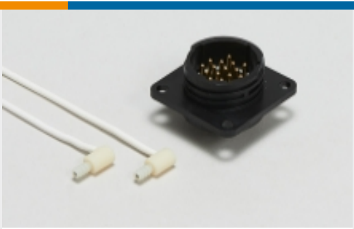
Circular Power Connectors(458)