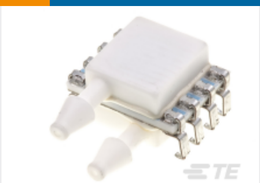
TE Part # 4515-DS3A030DP 30IN DP PRESSURE SENSOR 10% TO 90%