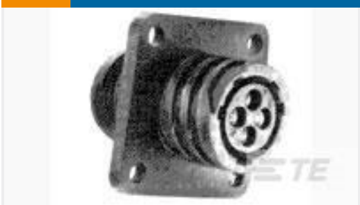
TE Part # 211102-1 CPC RECEPT ASSEMBLY SIZE 11-4