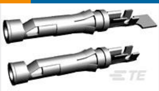
TE Part # 66399-4 III+ SKT,24-20,30AU/FL,LP