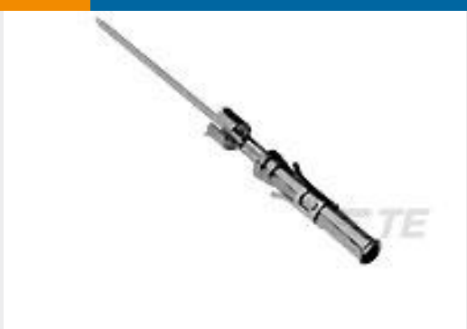
TE Part # 6-66461-3 SKT,.062 DIA,.025 SQ POST,LP