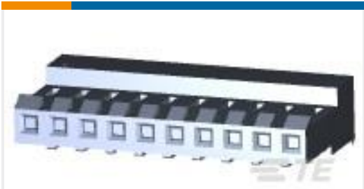
TE Part # 4-640427-0 10P MTA156 CONN ASSY 20AWG YEL