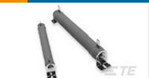
TE Part # 1879453-9 TE 1000W 4R7 5% Bracket