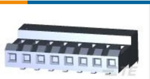
TE Part # 3-640427-8 08P MTA156 CONN ASSY 20AWG YEL