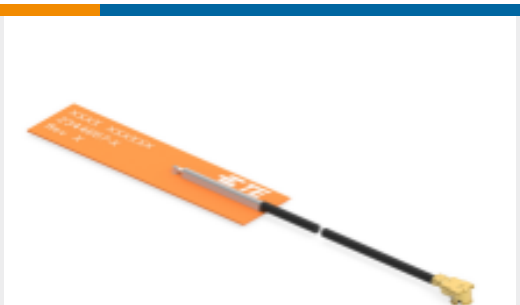
TE Part # 2344657-2 FPC ANTENNA, CABLE, MHF, Wi-Fi TRIPLE