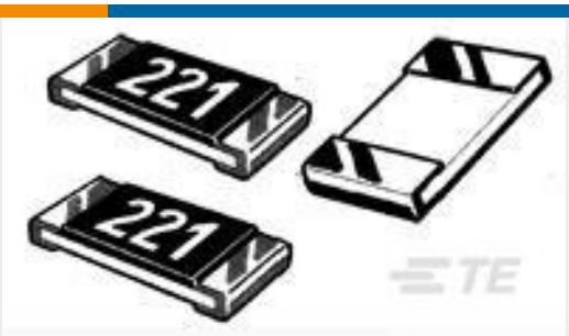
TE Part # 1-2176231-2 3522 30R 1% 3W