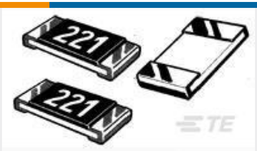
TE Part # 2-2176070-2 3521 75R 1% 2W