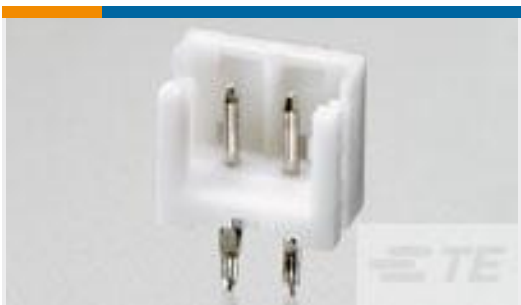
TE Part # 177537-3 2.5 M.I.S POST HDR ASSY 3P