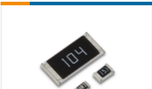
TE Part # 3-2176339-4 CRGCO 0603 5K6 1%