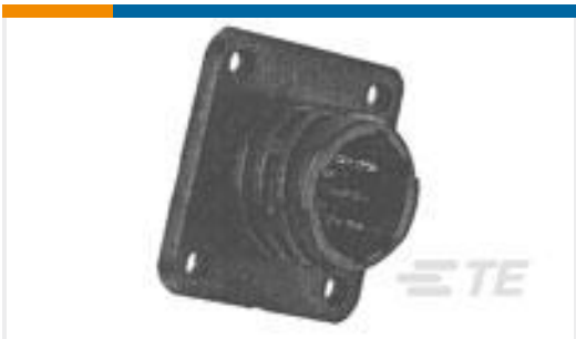
TE Part # 205841-3 CPC RECPT ASSEMBLY SIZE 11-8