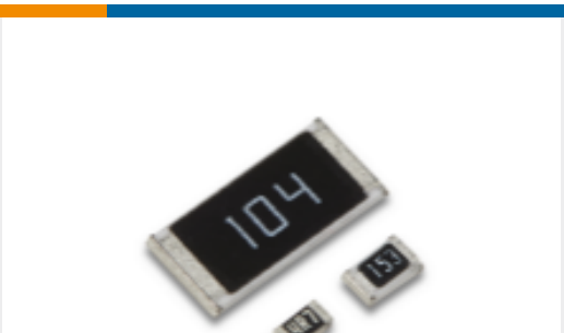
TE Part # 2-2176337-5 CRGCO 0402 1K0 1%