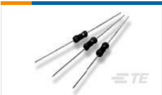
TE Part # 1-1625885-4 1W SM M/OX 5% 10R