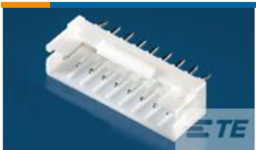
TE Part # 1-1735446-2 2MM PITCH HPI POST HEADER, VERTICAL, 12P