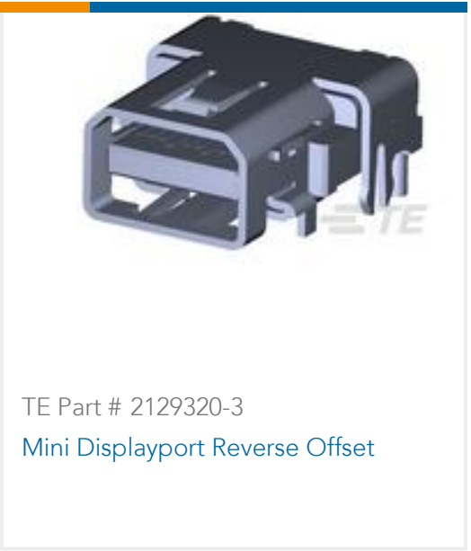
TE Part # 2129320-3 Mini Displayport Reverse Offset