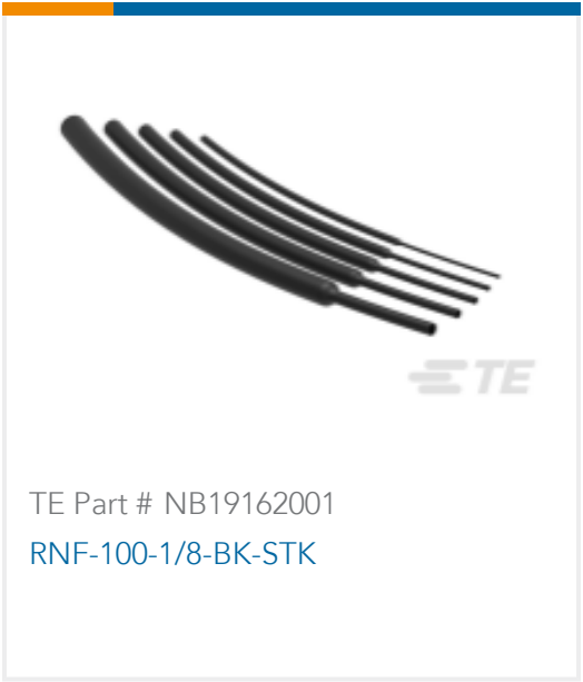
TE Part # NB19162001 RNF-100-1/8-BK-STK