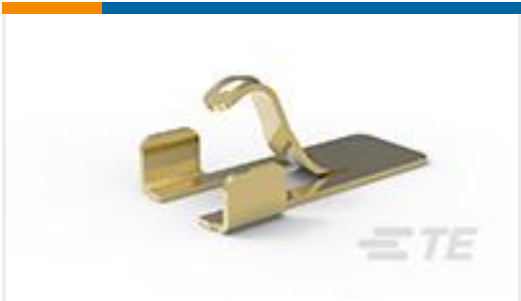
TE Part # 2199248-6 Shield Finger, Loose Piece, Type A, 1.6 h