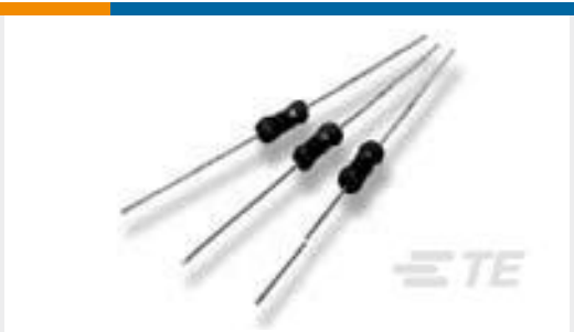
TE Part # 2-1879352-4 RR02 5% 3R0 AMMO