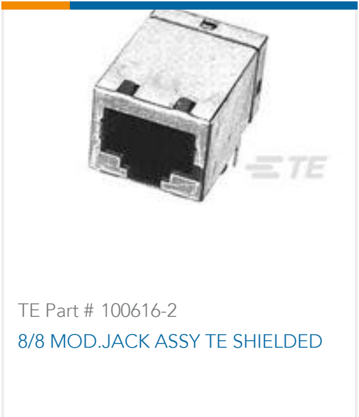
TE Part # 100616-2 8/8 MOD.JACK ASSY TE SHIELDED