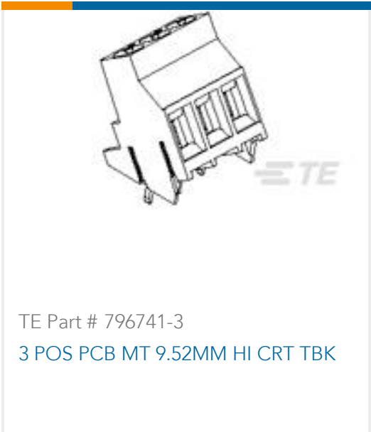
TE Part # 796741-3 3 POS PCB MT 9.52MM HI CRT TBK