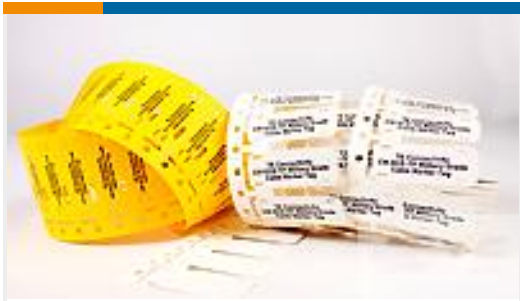
TE Part # 768838-000 CM-SCE-TP-1/4-4H-9