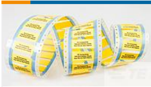
TE Part # 6641710001 TMS-SCE-1/4-2.0-9