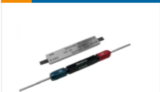
TE Part # 525442-4 PLUG GAUGE, HANDTOOL