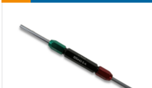
TE Part # 525442-5 PLUG GAUGE, HANDTOOL