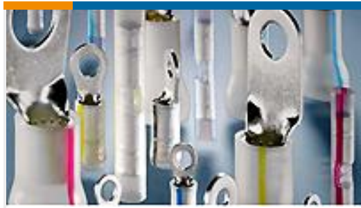
TE Part # 53409-1 PIDG PVF2 22-16COMM22-18MIL 10