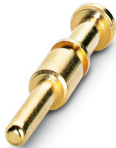
Crimp contact, Pin, turned, contact diameter: 2 mm, crimp range: 0.25 mm 2 ... 1 mm 2 , Alternative product in accordance with RoHS II without Exemption 6c (Pb < 0.1 %) item no.: 1242329

Please be informed that the data shown in this PDF document is generated from our online catalog. Please find the complete data in the user documentation. Our general terms of use for downloads are valid.