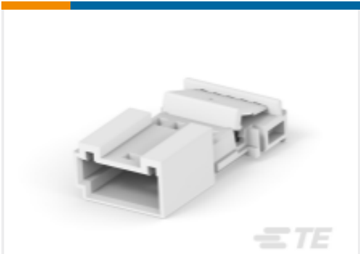
TE Part # 2-968696-3 4POS MQS TAB COD B