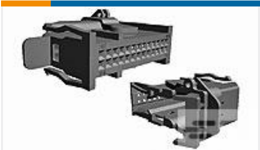
TE Part # 1326362-1 26WAY LAC "COMMON" SHIELD ASMB