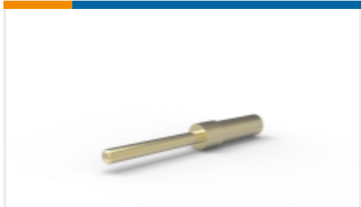
TE Part # 2334110-2 PIN CRIMP CONTACT AWG 20-24