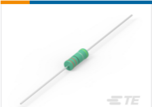
TE Part # 2176611-1 EP 2W (SS) 1R0 5%