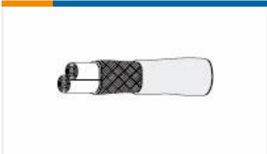
TE Part # 913237-000 55A1811-20-9-9CS2275