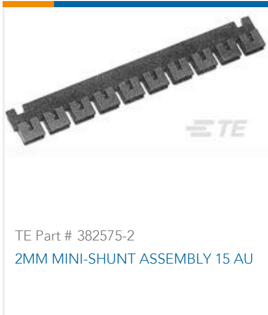
TE Part # 382575-2 2MM MINI-SHUNT ASSEMBLY 15 AU