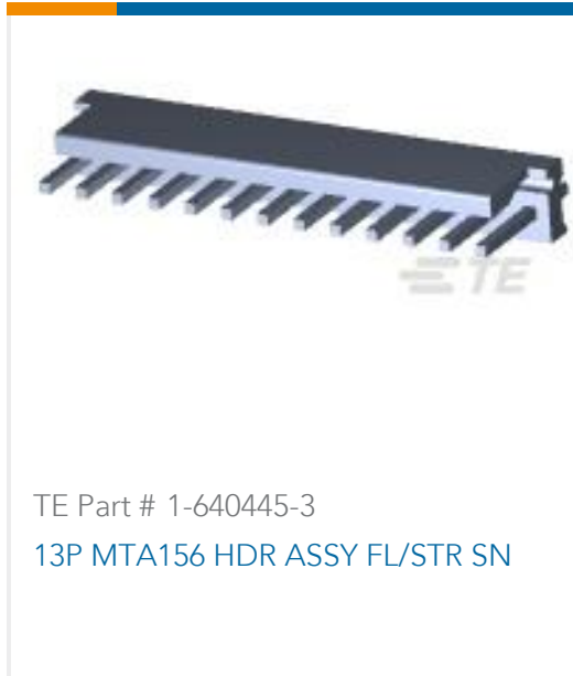
TE Part # 1-640445-3 13P MTA156 HDR ASSY FL/STR SN