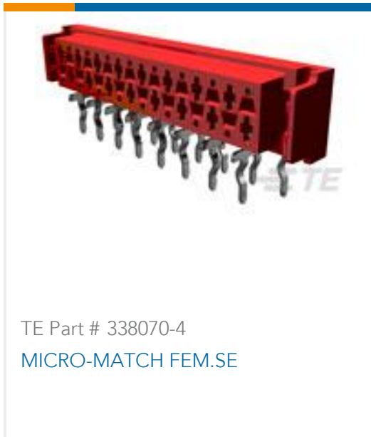
TE Part # 338070-4 MICRO-MATCH FEM.SE