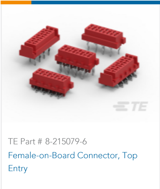
TE Part # 8-215079-6 Female-on-Board Connector, Top Entry