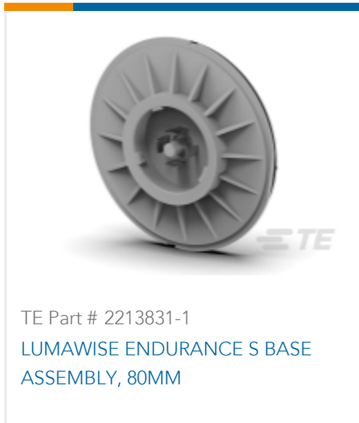
TE Part # 2213831-1 LUMAWISE ENDURANCE S BASE ASSEMBLY, 80MM