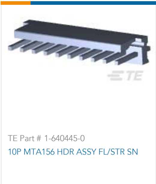
TE Part # 1-640445-0 10P MTA156 HDR ASSY FL/STR SN