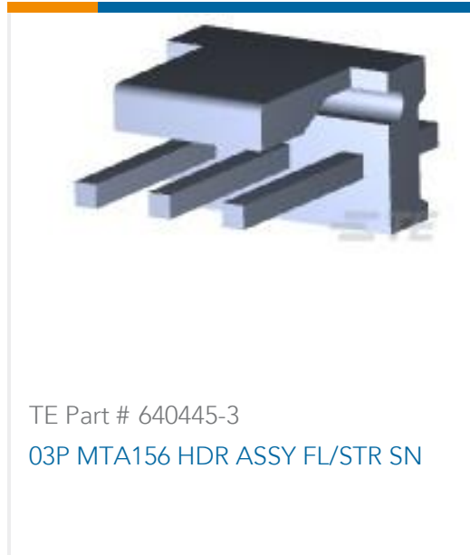
TE Part # 640445-3 03P MTA156 HDR ASSY FL/STR SN