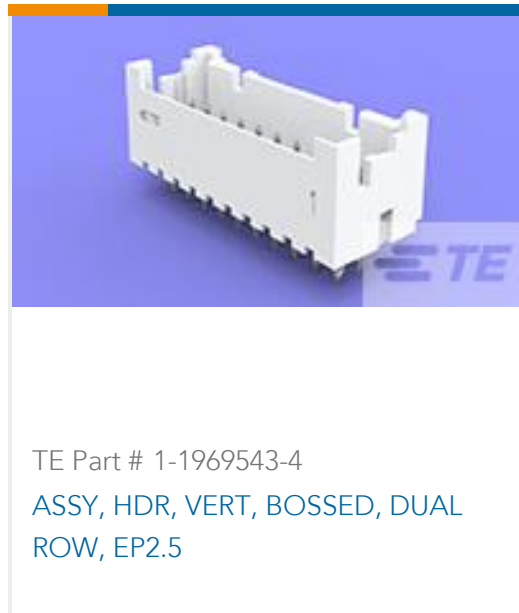
TE Part # 1-1969543-4 ASSY, HDR, VERT, BOSSED, DUAL ROW, EP2.5