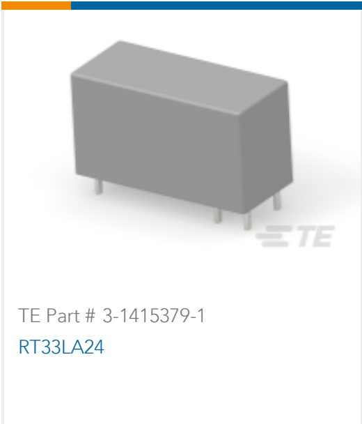
TE Part # 3-1415379-1 RT33LA24