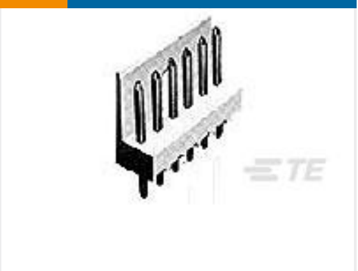
TE Part # 173081-3 EIS POST ASSY V 3P GOLD NATU.