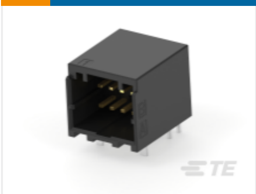
TE Part # 1-1827872-3 Header Assembly: Wire-to-Board, 3A, Gold or Tin Plated