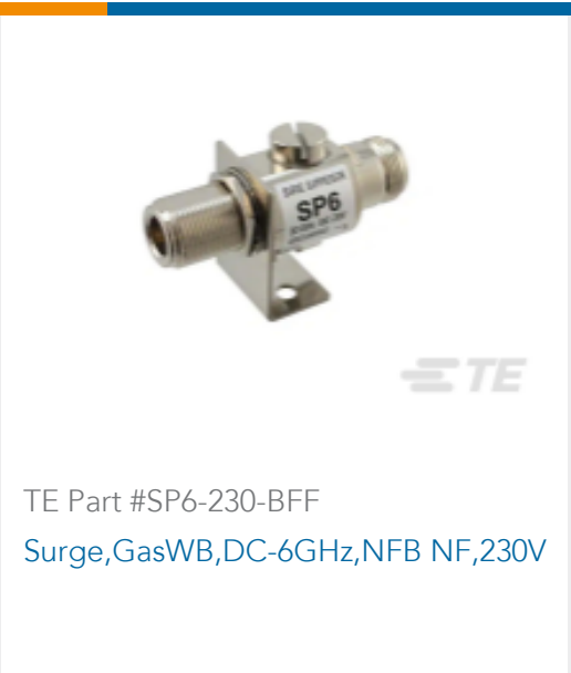
TE Part #SP6-230-BFF Surge, Gas WB, DC-6GHz, NFB NF, 230V