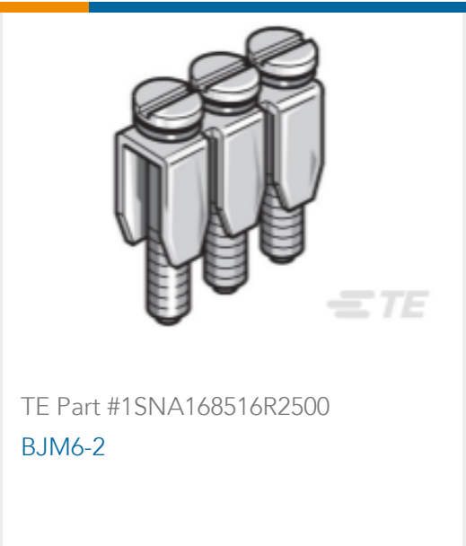
TE Part #1SNA168516R2500 BJM6-2