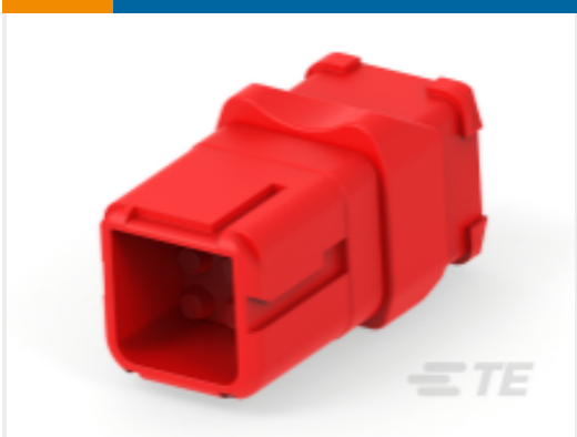
TE Part # D369-R99-NS1 Rectangular Connectors, 9 Way Receptacle