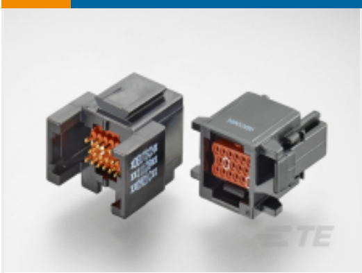
TE Part # ABC03N-22S-4048 IN-LINE RECP