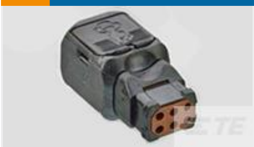
TE Part # D369-P66-NS1 369 6 WAY PLUG, CRIMP, SKT