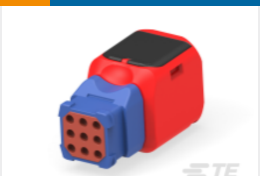
TE Part # D369-P99-NP1 Rectangular Connectors: 9-Way Plug