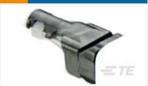
TE Part # D369-STB-6 369 6 WAY BACKSHELL STRAIGHT TIE WRAP