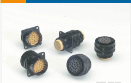
TE Part # ZPF000000000018795 FDDBA 53H 10-6 PN-K