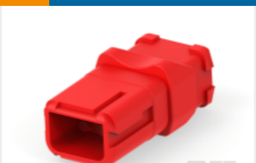
TE Part # D369-R66-NS1 Rectangular Connectors, 6 Way Receptacle