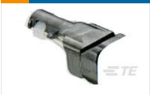
TE Part # D369-STB-9 369 9 WAY BACKSHELL STRAIGHT TIE WRAP