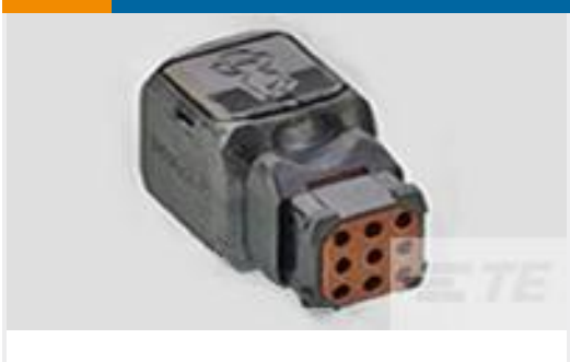
TE Part # D369-R99-NP1 369 9 WAY REC, CRIMP, PIN