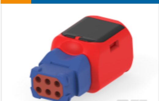
TE Part # D369-P66-NS1 Rectangular Connectors: 6-Way Plug