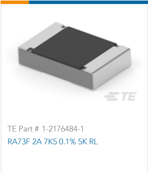
TE Part # 1-2176484-1 RA73F 2A 7K5 0.1% 5K RL