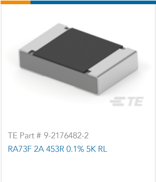
TE Part # 9-2176482-2 RA73F 2A 453R 0.1% 5K RL