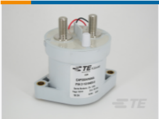
TE Part # 2-1618405-0 CAP200ARANA=CONTACTOR SPST-NO 28V