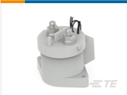
TE Part # 8-1618395-0 CAP200HADEA=CONTACTOR, SPST-NO, 1PST AUX