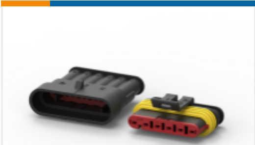
TE Part # 282104-1 AMP SUPERSEAL 1.5MM, CONNECTOR HOUSING