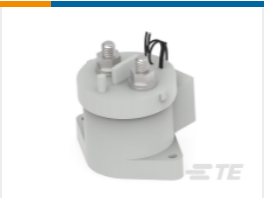
TE Part # 2-1618405-2 CAP200HRANA=CONTACTOR SPST-NO 28V