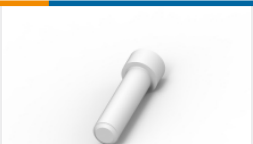
TE Part # 114017-ZZ SEALING PLUG, SIZE 12/16, WHT