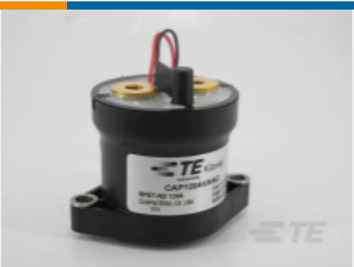
TE Part # 2-1618411-9 CAP120AVANG=CONTACTOR, SPST-NO, 12V COIL