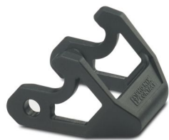
Replacement latch for HC-D7 housing

Please be informed that the data shown in this PDF document is generated from our online catalog. Please find the complete data in the user documentation. Our general terms of use for downloads are valid.