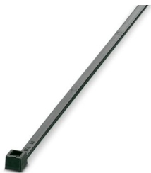
Cable binders for quick and secure bundling, standard version

Please be informed that the data shown in this PDF document is generated from our online catalog. Please find the complete data in the user documentation. Our general terms of use for downloads are valid.