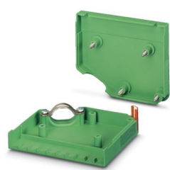
Cable housing, color: green, product range: KGS-PC 4

Please be informed that the data shown in this PDF document is generated from our online catalog. Please find the complete data in the user documentation. Our general terms of use for downloads are valid.