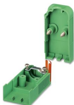
Cable housing, color: green, product range: KGG-PC 4

Please be informed that the data shown in this PDF document is generated from our online catalog. Please find the complete data in the user documentation. Our general terms of use for downloads are valid.