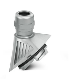
EVO EMC cable gland with bayonet locking, B series, size M20, cable diameter: 9 ... 13 mm

Please be informed that the data shown in this PDF document is generated from our online catalog. Please find the complete data in the user documentation. Our general terms of use for downloads are valid.