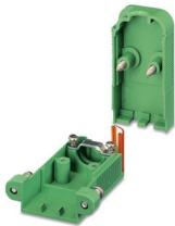
Cable housing, color: green, product range: KGG-PC 4/..-F

Please be informed that the data shown in this PDF document is generated from our online catalog. Please find the complete data in the user documentation. Our general terms of use for downloads are valid.