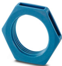
Nut, Range of articles: PRC 35, color: blue, NOTE: For indoor use only

Please be informed that the data shown in this PDF document is generated from our online catalog. Please find the complete data in the user documentation. Our general terms of use for downloads are valid.