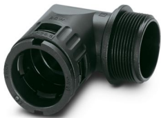
Cable gland, metric thread, IP66 protection, angled

https://www.phoenixcontact.com/us/products/3240928