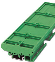
Side element, 11.25 mm wide, without marker groove

Please be informed that the data shown in this PDF document is generated from our online catalog. Please find the complete data in the user documentation. Our general terms of use for downloads are valid.