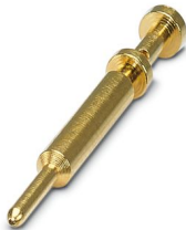
Crimp contact, Pin, turned, contact diameter: 1 mm, crimp range: 0.06 mm 2 ... 0.25 mm 2

Please be informed that the data shown in this PDF document is generated from our online catalog. Please find the complete data in the user documentation. Our general terms of use for downloads are valid.