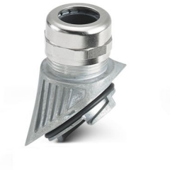
EVO EMC cable gland with bayonet locking, B series, size M32, cable diameter: 14 ... 21 mm

Please be informed that the data shown in this PDF document is generated from our online catalog. Please find the complete data in the user documentation. Our general terms of use for downloads are valid.