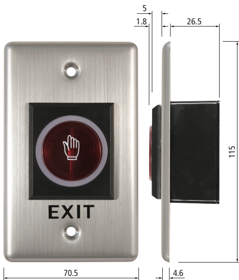
All dimensions in mm