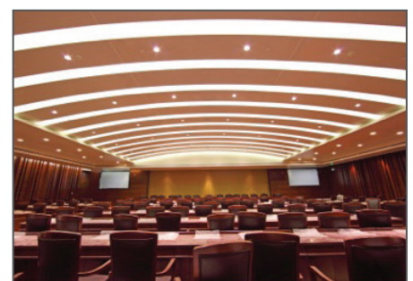
LED panel-lighting applications